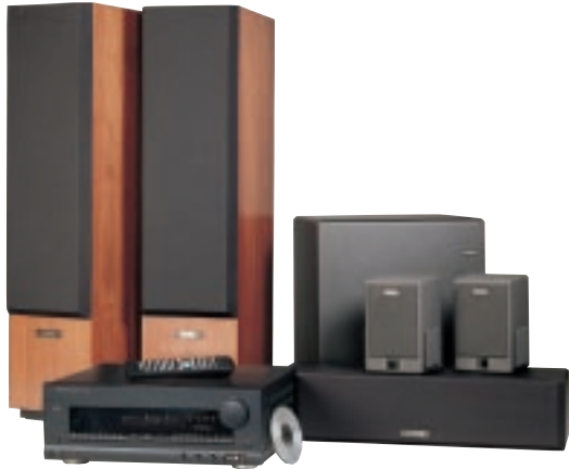
Complete Home Theater Systems