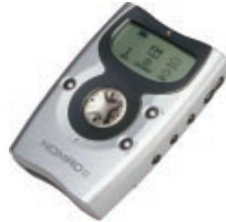
MP3 Digital Music Recorder/Players