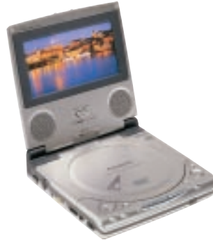
Home and Portable DVD Players